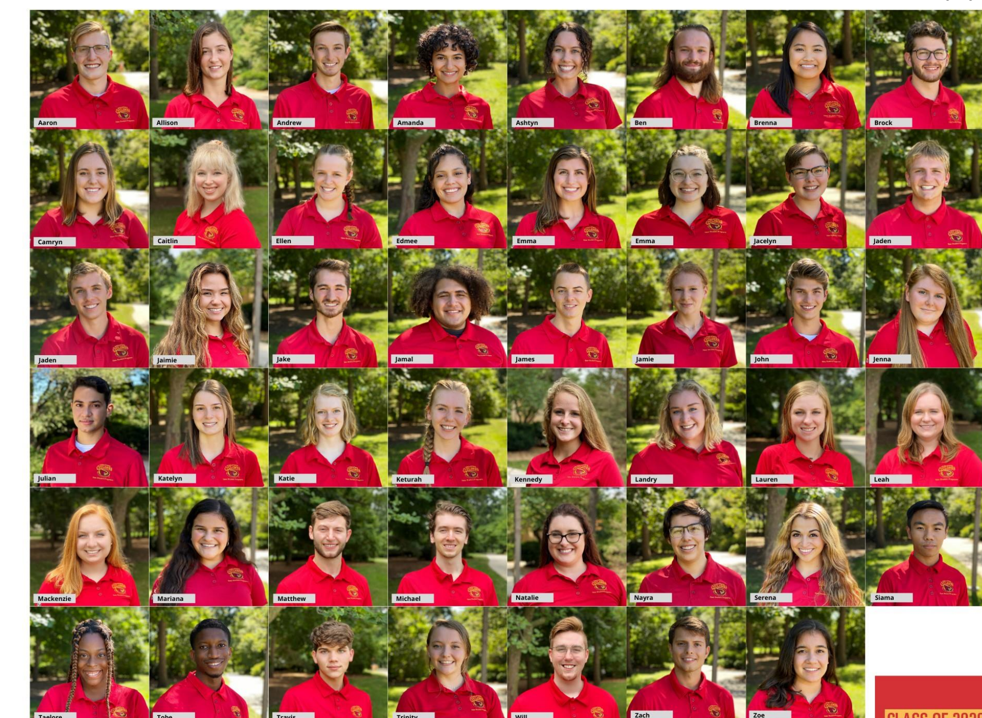
CLASS OF 2020