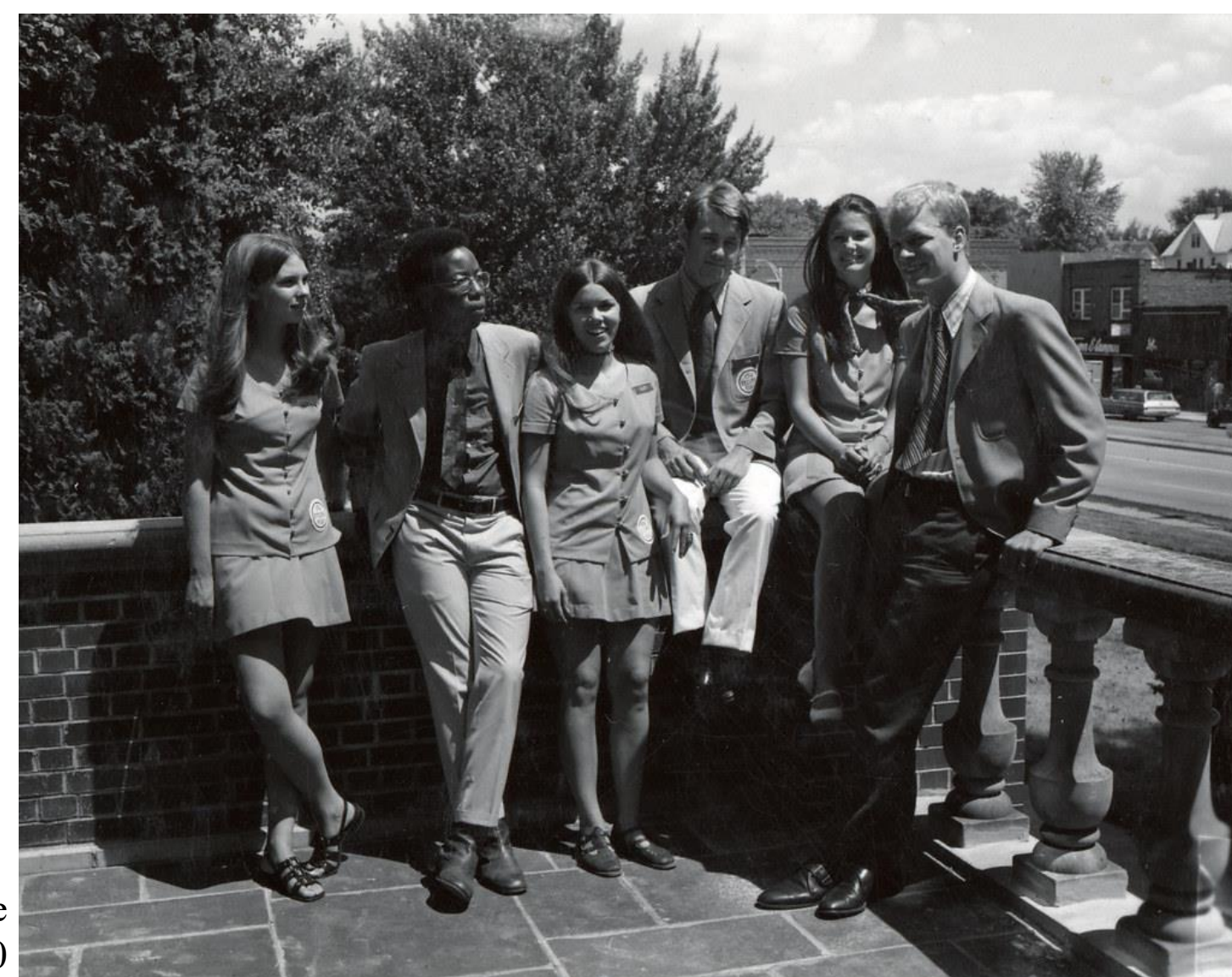
Cyclone Aide Class of 1970

History and class pictures were collected from University Archives and New Student Programs staff. FAQs were collected from Cyclone Aides, New Student Programs staff, and the current website. I used Google Forms to collect Cyclone Aide testimonials and shared the information with Cyclone Aide Alumni through a Facebook Group.