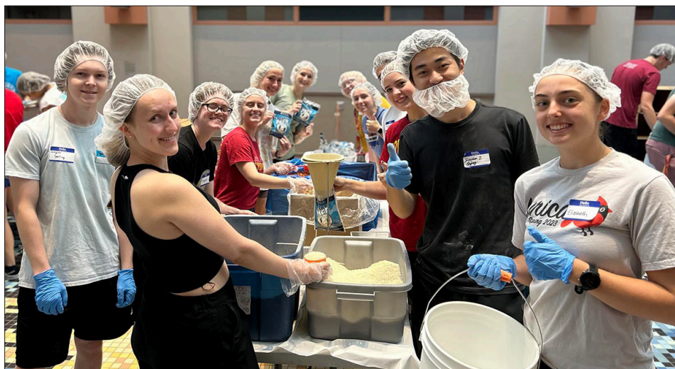
Honors 121, Section D3, volunteering with Meals from the Heartland to pack meals on-campus.

Finally, the Fall 2023 semester concluded with our bi-annual poster session and convocation event. This semester, 62 upper-division students presented at the poster session, including 28 graduating seniors who recently joined your ranks as alumni. An additional 7 Outstanding First-Year Honors Mentor Program Award recipients shared their research as well. We are so incredibly proud of those who presented their research and all the other dedicated students working toward their goal of graduating with honors.